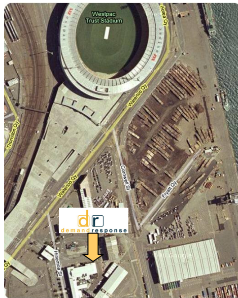
demandresponse Wellington office

Growth in the business and the team has led to us moving to a bigger and better office in the Harbour Quays area of the capital. We are just in the New Zealand Rugby Union building and just across the road from the Westpac Stadium.